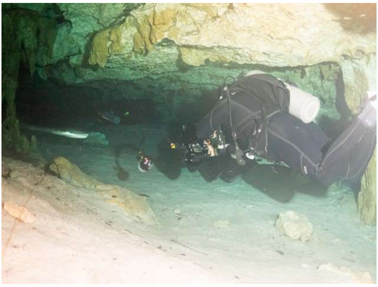
2 more pictures from Mike's recent trip