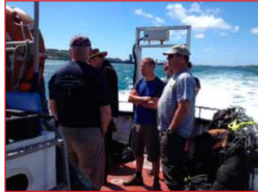
Predator - dive deck & bonding area