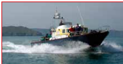
Predator - Dive Pembrokeshire