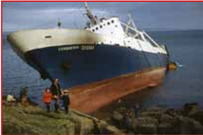
THE CONQUEROR ran aground off Mousehole in 1977

The Conqueror had been scrubbed by the winter storms, exposing more of the ship from beneath the kelp.