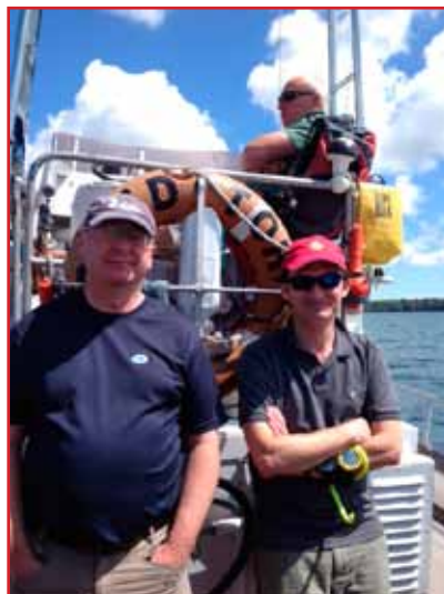
Captain Gadget keeps a look out for Great Whites